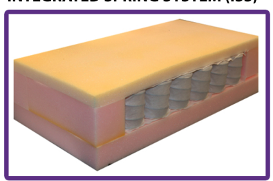
A marshall spring unit enclosed in polyurethane foam and edged with polyester fiber. Independently active coil springs provide luxurious comfort and support.