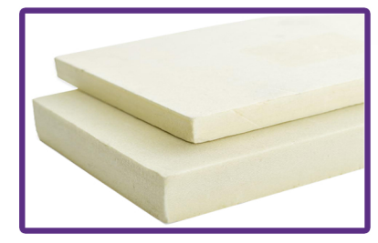
High grade polyurethane foam that comes in many types, densities, and sizes. Our standard foam is both durable and comfortable.